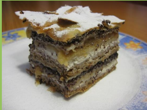
Prekmurska gibanica (Over Mura Moving Cake)