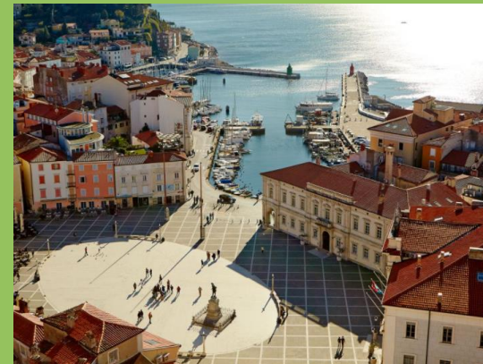
Tartinijev trg in Piran